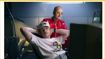
Finland Windows95man - No Rules!